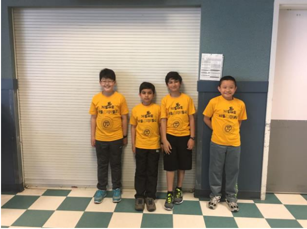
2017 Math is Cool Masters Grades 4, 5 and 6 (i and phi division) May 20, 2017 School Results